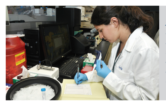
The training program is designed to impart the training and skills necessary to submit a competitive career development (K) award.

Applicants must be U.S. citizens or permanent residents.